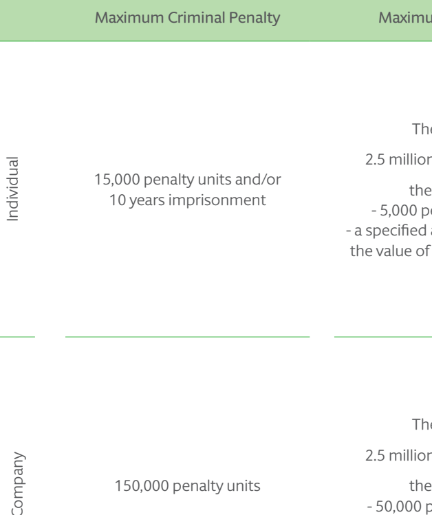
Figure 8 - Penalties

Note: the current value of 1 penalty unit is A$222